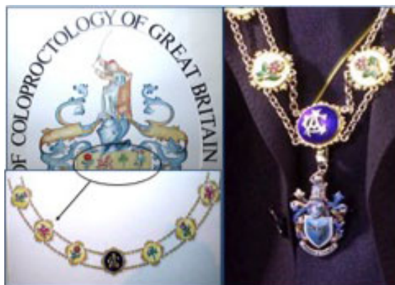
Figure 4 The presidential chain of office showing the national emblems taken from the coat of arms

The second ceremonial marker, worn by every President since 2002, was the gold-enamelled presidential badge, struck in Sheffield in 1994, and a chain of office (Figure 4), commissioned later in Birmingham and costing around £4000 (about £8000 in today’s prices). The badge features the coat of arms. The chain has sequential national emblems of England, Scotland, Wales and Ireland. These national emblems were symbolically important for the ACPGBI. Whilst both developments might now be considered anachronistic, the coat of arms currently remains the internationally recognisable symbol of the ACPGBI.