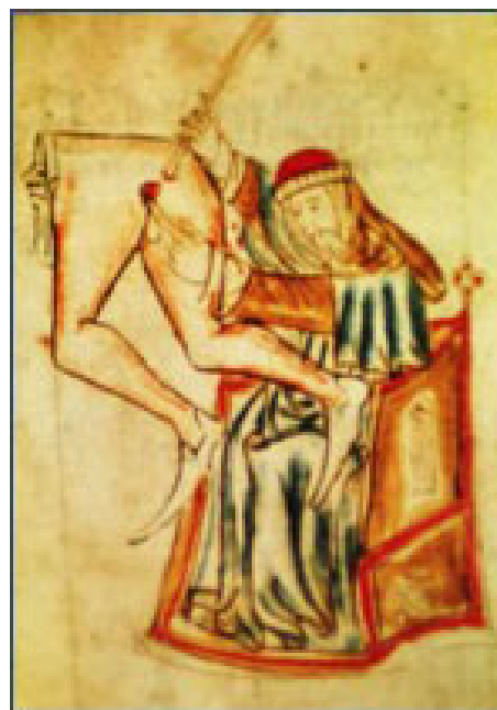
Figure 3 John of Arderne

The second ceremonial marker, worn by every President since 2002, was the gold-enamelled presidential badge, struck in Sheffield in 1994, and a chain of office (Figure 4), commissioned later in Birmingham and costing around £4000 (about £8000 in today’s prices). The badge features the coat of arms. The chain has sequential national emblems of England, Scotland, Wales and Ireland. These national emblems were symbolically important for the ACPGBI. Whilst both developments might now be considered anachronistic, the coat of arms currently remains the internationally recognisable symbol of the ACPGBI.