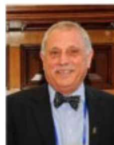
Figure 8 Najib Haboubi, the only nonsurgical President of the ACPGBI (2009–10)

In October 2011 the ACPGBI investigated the WebEx teleconference system. Whilst the technology was considered potentially suitable for executive meetings it was not until the COVID-19 pandemic in 2020, with forced social distancing, that video conferencing really became established. The Council and Executive of the time embraced the technology with a barrage of meetings, hugely facilitating access amongst Executive and Council members, at one stage several times per week. The Association has subsequently invested heavily with the intent to continue its use.