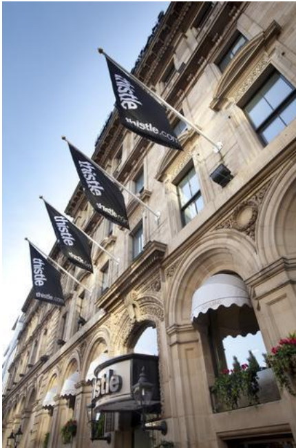
Portland Hotel, Portland Street, Manchester

Programme designed to build a pelvic floor network with sessions on: